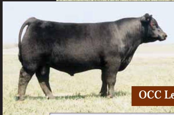
OCC Legend 616L