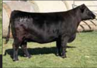
Jaua Emblazon 822 644, dam of Lot 33.