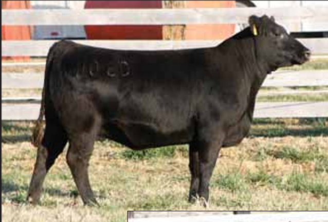
Sandeen Lady 0304, Lot 53

Lots 53 - 56 is a set of Commercial Angus heifers sired by our Tharpe Angus bull. They are moderate framed, deep bodied heifers that will make tremendous cows. Bred to Built Right for a set of beautiful baldy, 1/2 blood heifer calves.