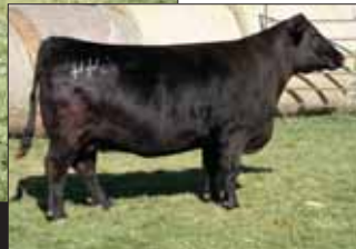
Jaue Emblazon 822 644, dam of Lot 40, 41 & 42.