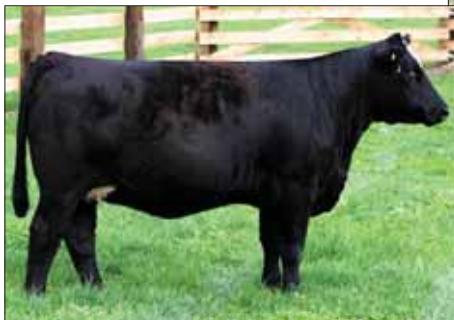
856, maternal sister to Lot 93.