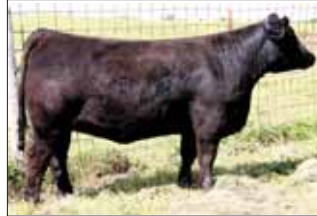
Drake Look Like an Angel, dam of Lot 18