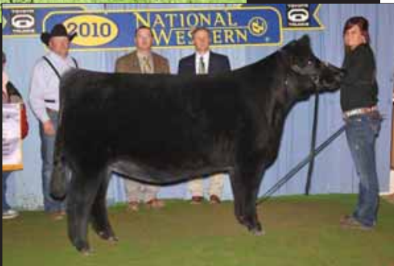
Miss Meadow Spring 810U