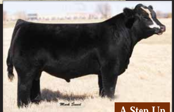
A Step Up