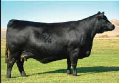
Coleman Donna 386, dam of Sandeen Donna 8386