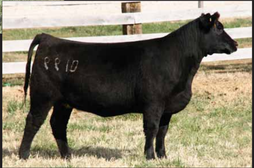
Sandeen Lady 0199, Lot 13