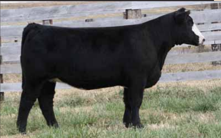
Sandeem Lady 0220, Lot 29