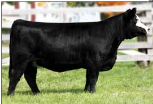
Sandeen Lady 825