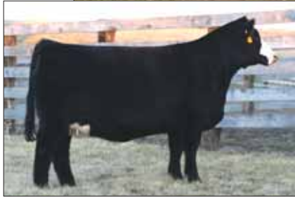
KS She's So Sweet,