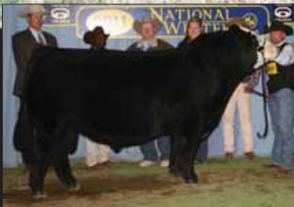
Remington Lock N Load