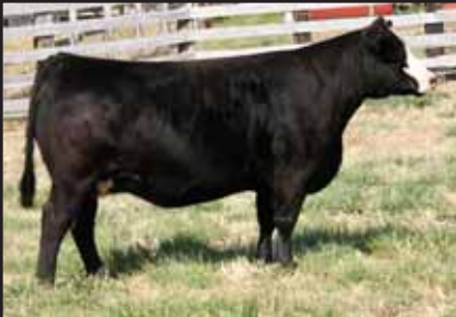
Donna 7386, a full sister to Sandeen Donna 8386.