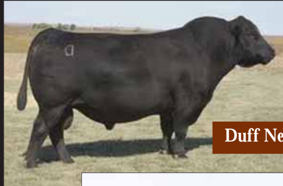
Duff New Look