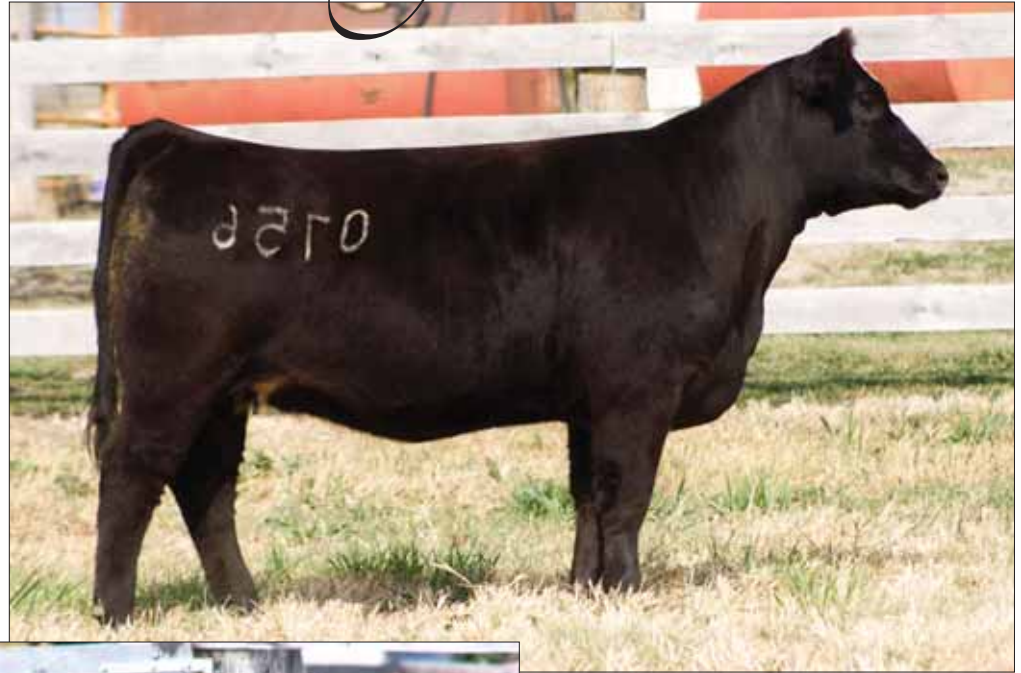
Sandeen Lady 0756, Lot 10

This is a really good set of flushmate sisters. All but two are star headed. Their dam, Blackbird 116, has been a very constant producer of some of our very best heifers and bulls in years past. These heifers should be extremely fertile and milk great. The Coleman Angus Ranch in Montana is beginning to dominate the Angus breed in terms of producing maternal genetics and the 116 cow was one of our first donors purchased from there. This is what the Sim/Angus business is about - deep, thick, stout females that are easy keeping and easy to look at.