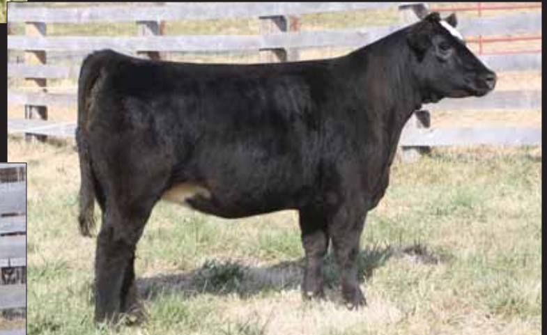
Sandeem Lady 09, Lot 28