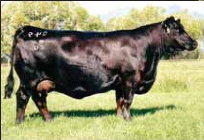
KMK Donna J311, granddam of Sandeen Donna 8386