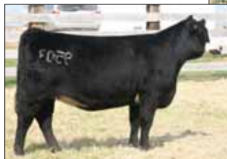
9503, a maternal sister to Lot 20.