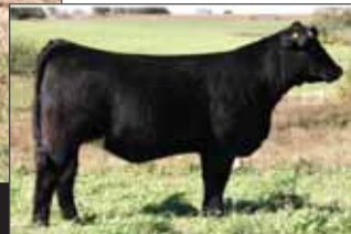
Lot 28 from 2009 No Bull Sale.