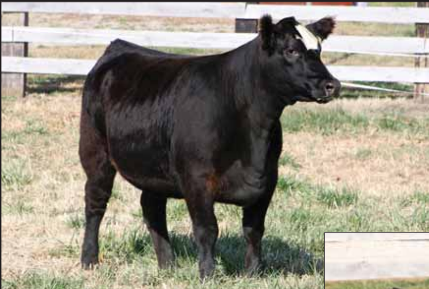
Sandeen Lady 0221, Lot 12