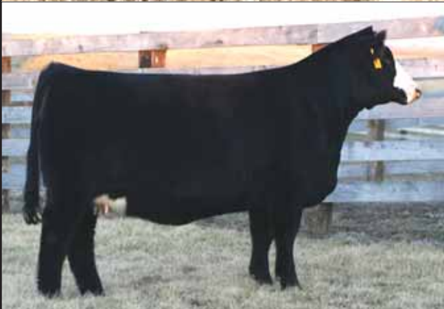
She's So Sweet