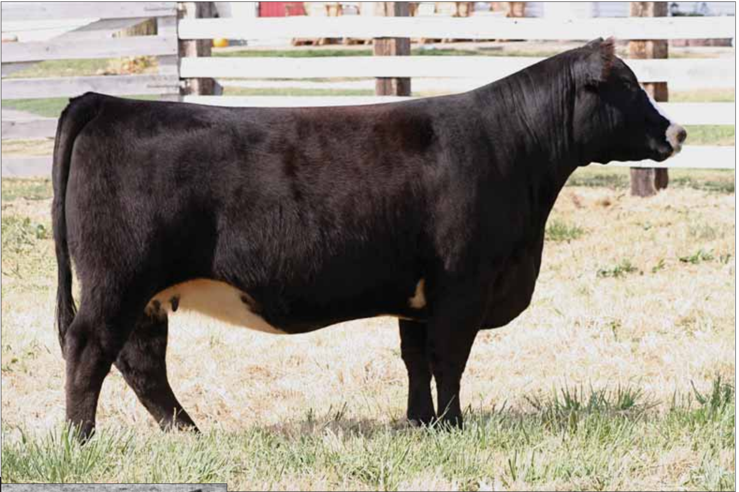
Sandeen Lady 865, Lot 5