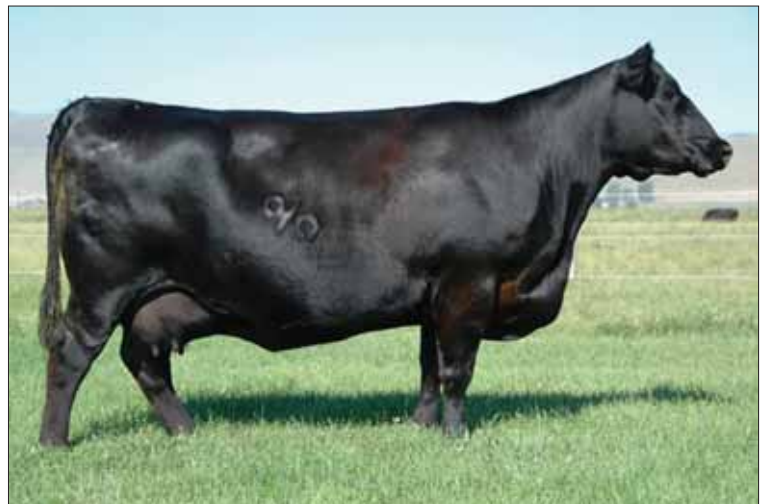
Coleman Blackbird 116, dam of Lot 9