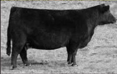
Miss Aberdeen, dam of Lot 5