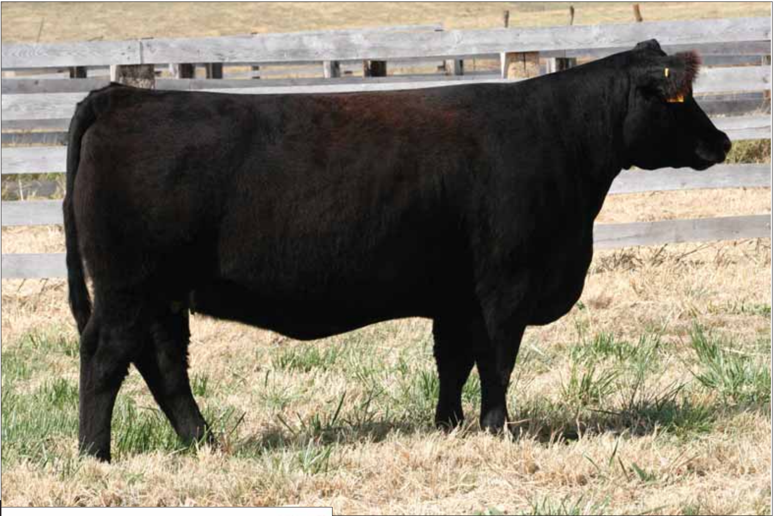
TJSC Sweet 83U