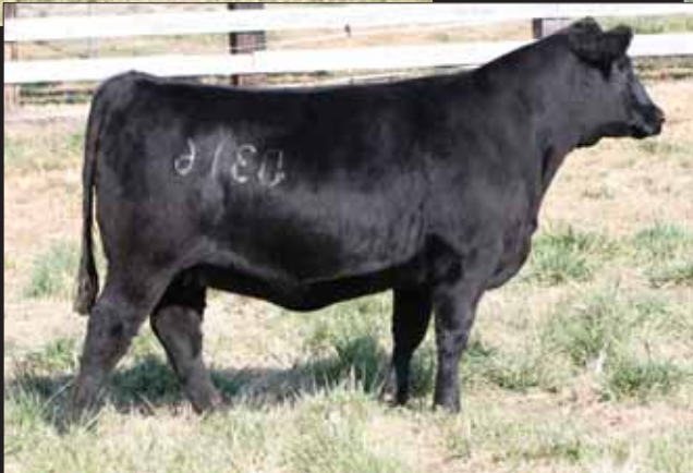
Sandeen Lady 0316, Lot 55