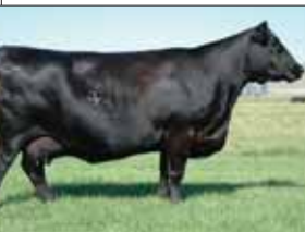
Coleman Blackbird 116, dam of Lot 10 & 11.