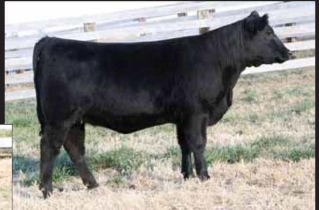
Sandeen Lady 0403, Lot 54