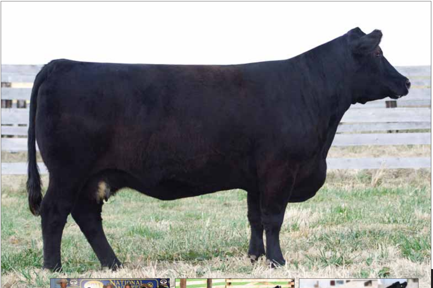
Sandeen Lady 621T, Lot 4