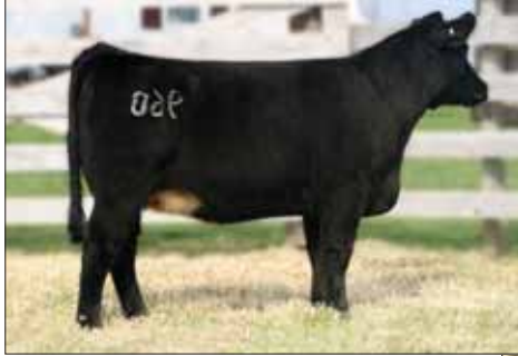
960, full sister to Lot 92.