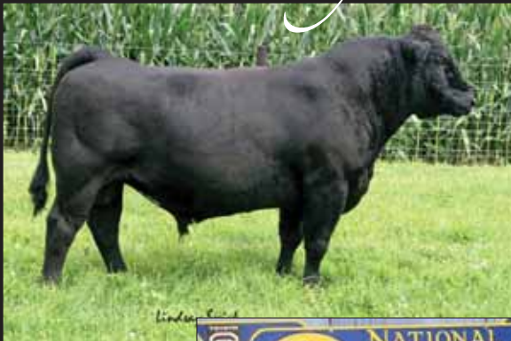
DHF Jades Secret Agent