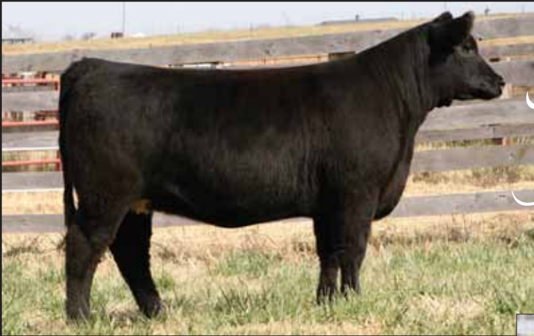
Sandeem Lady 0320, Lot 27