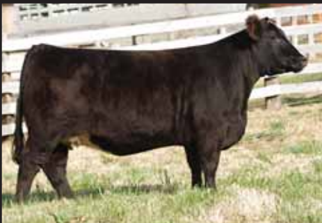
Sandeen 895, a full sister to Lot 5