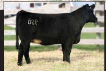
960, maternal sib to Lot 4