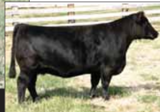
Sandeen Lady 8056, dam of Lot 23.